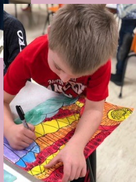
Zentangling Techniques in 1st grade Landscapes