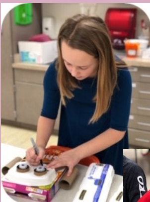
3rd— Recycled Robots in the Library!