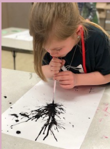
Blowing Indian Ink & writing in Japanese for our Cherry Blossoms