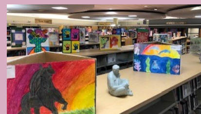
NS Eldridge Library K-12 Art Display